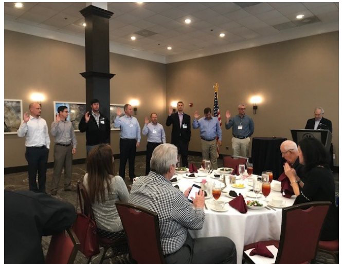
2019 Officers and Directors