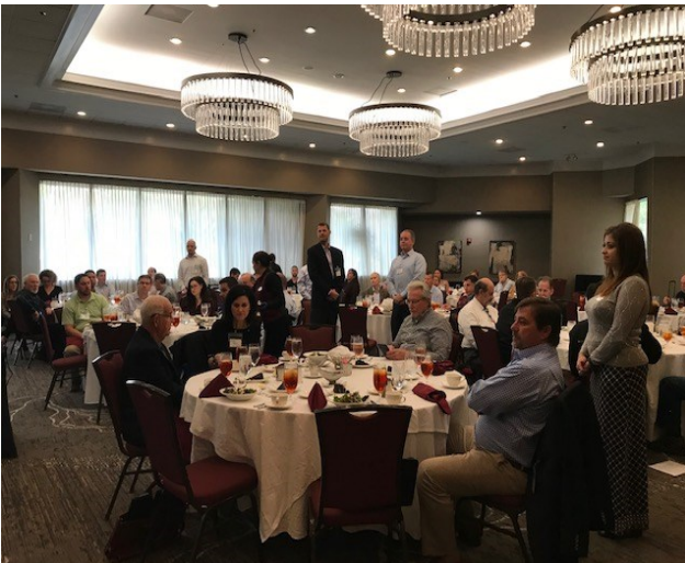
2018 Outgoing Officers and Directors