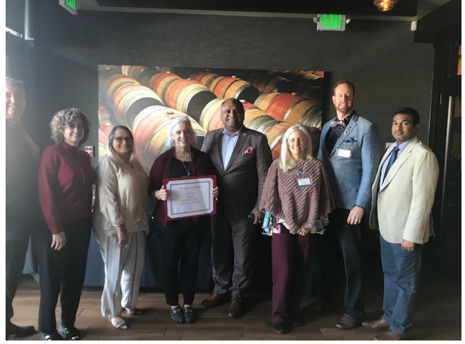
Orange County Property Appraisers congratulating their new MAI