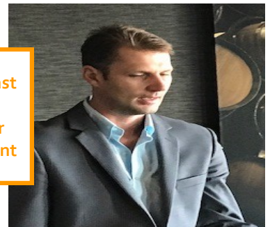
2020 East Fl Chapter President