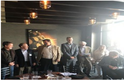
Thank you to our 2019 Officers and Directors