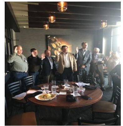
Welcome our 2020 Officers and Directors