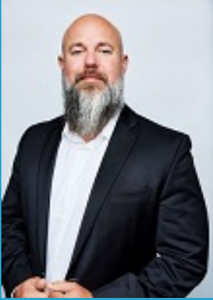
2026 Chapter President

As we enter 2026, I am both honored and energized to serve as President of the East Florida Chapter of the Appraisal Institute. This is a moment of opportunity that I want to be focused on our chapter membership. But to be successful, I feel there is a need for engagement from all, with a shared commitment to the future of the appraisal profession I know we all have. The appraisal profession is evolving rapidly. Markets are changing, technology and data are reshaping how we work, and expectations around credibility and independence continue to rise. I feel the Appraisal Institute plays a critical role that leads with our Chapter.